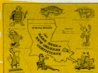
The Rare Ones Of New Orleans Award.